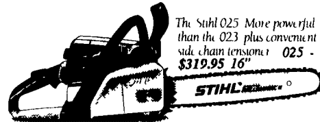
The Stihl 025 More powerful than the 023 plus convenient side chain tensioner 025 - $319.95 16"