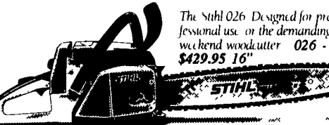
The Stihl 026 Designed for professional use on the demanding weekend woodcutter 026 - $429.95 16"