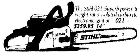
The Stihl 021 Superb power to weight ratio isolated carburetor electronic ignition 021 - $259.95 14"