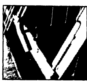
& Water Troughs