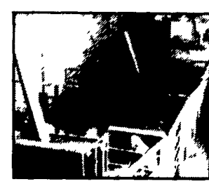
Solid Steel Nursery Penning

WE CAN CUSTOM FABRICATE EQUIPMENT TO MEET