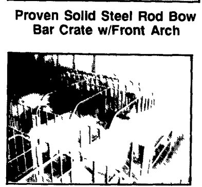
Solid Steel Rod Gestation Stalls