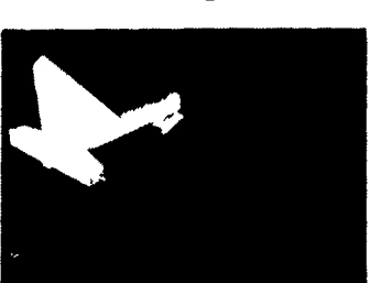
LANDSCAPE RAKES 48" Through 96"