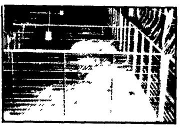
Solid Steel Breeding Penning