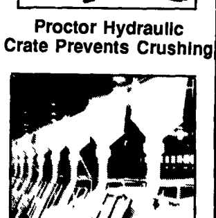
Surprise Sow Feeding Systems