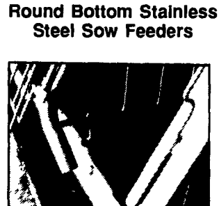
Stainless Steel Feed