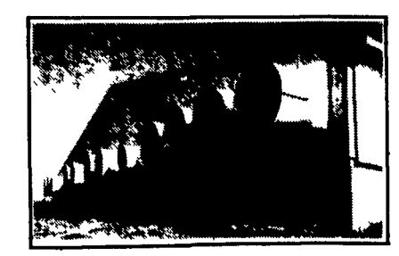
Tunnel Ventilation Fans By AAA (A), All Fiberglass Housings And Props With Lifetime Warranty