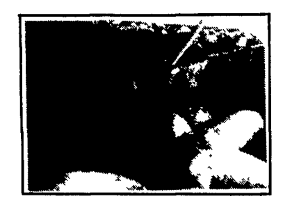
All Solid Steel Fencing With Stainless Stee Adjustable Feeders