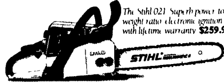
The Stihl 021 Superb power to weight ratio, electronic ignition with lifetime warranty $259.95