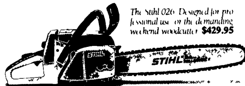
The Stihl 026 Designed for professional use on the demanding weekend woodcutter $429.95