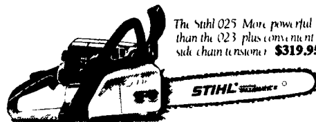
The Stihl 025 More powerful than the 023 plus convenient side chain tensioner $319.95