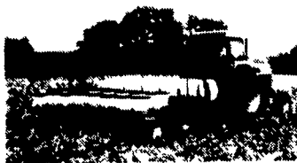
New 6600 Planter two-bar design features interplant row units

and wide array of attachments allow you to plant in nearly any field condition—no-till, mulch till, or finely worked—with row widths ranging from 15" to 40".