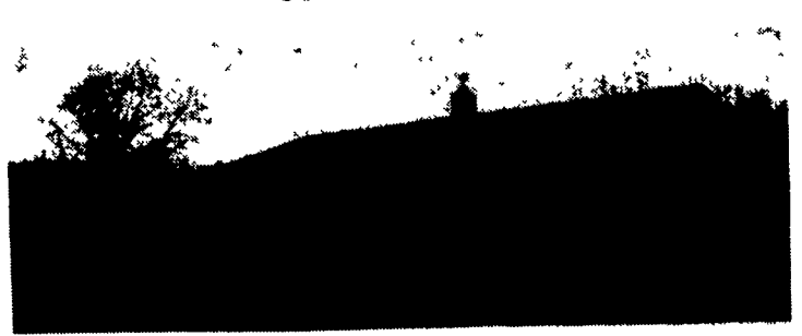
60x104 w/30' Stable Area