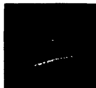
After The Shotcrete System repairs and replaces the missing structure.

Shotcrete is also good for repairing stone walls