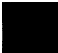
After With the hole repaired by Shotcrete and a new surface applied the silo is ready for years of use