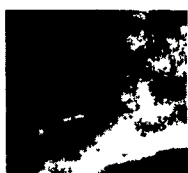
After The surface is reconditioned, and a new thick tough surface will protect stored feed