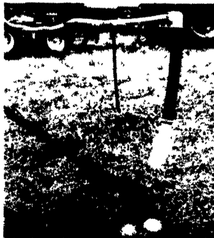
1½" dia. delivery tubes drop foam at ground level.