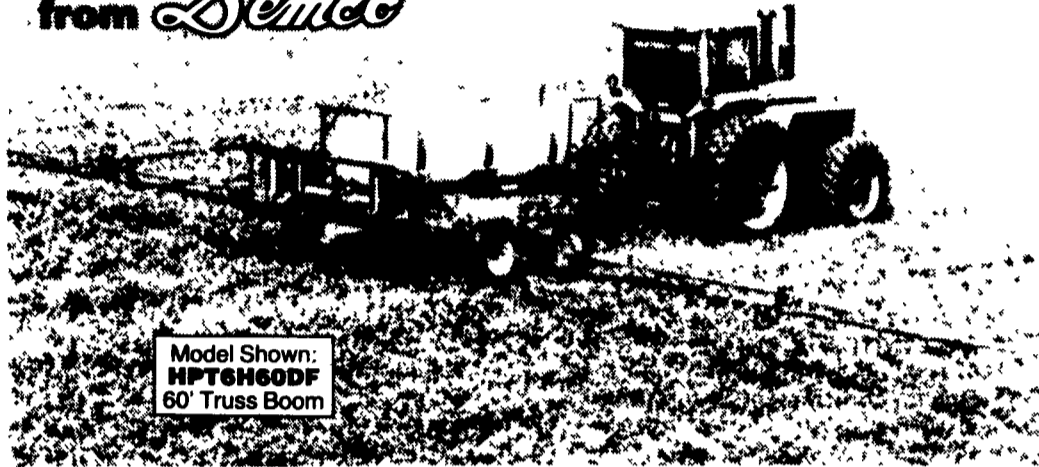
Model Shown: HPT6H60DF 60' Truss Boom