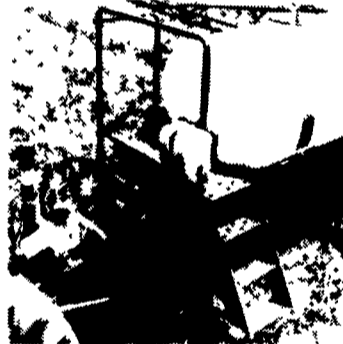
Large front mounted step, platform and safety rail for easy filling of the tank. Clean water tank is standard.