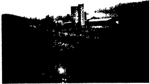
Huntingdon Co. 218 Ac.- Good Production Farm, 57 Stanchions with pipeline, 105 Free stalls + 3 silos. Price Reduced