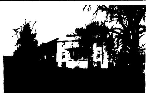
Huntingdon Co. 277 Ac. (200 Ac. Tillable-Good Land) 60 tie stalls with pipeline, 2 silos and 5 BR house. Price Reduced.