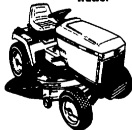
240 Lawn and Garden Tractor (shown w/Hubcaps)