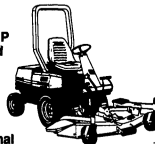
F911 Front Mower (shown w/60-Inch Deck)