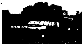
New 6600 Planter two-bar design features interplant row units

and wide array of attachments allow you to plant in nearly any field condition—no-till, mulch till, or finely worked—with row widths ranging from 15" to 40".