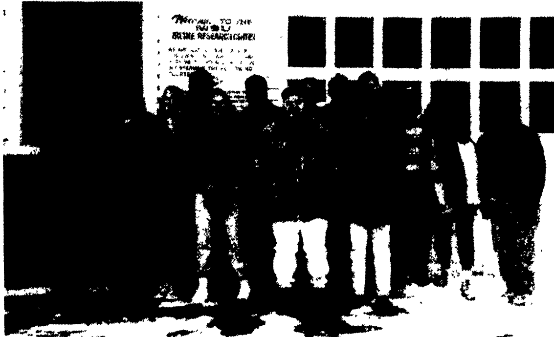
On January 12 at 5:30 a.m., 15 Penn Staters and five students from the University of Maryland left University Park to participate in the annual Block and Bridle Club National Convention hosted by Colorado State University.