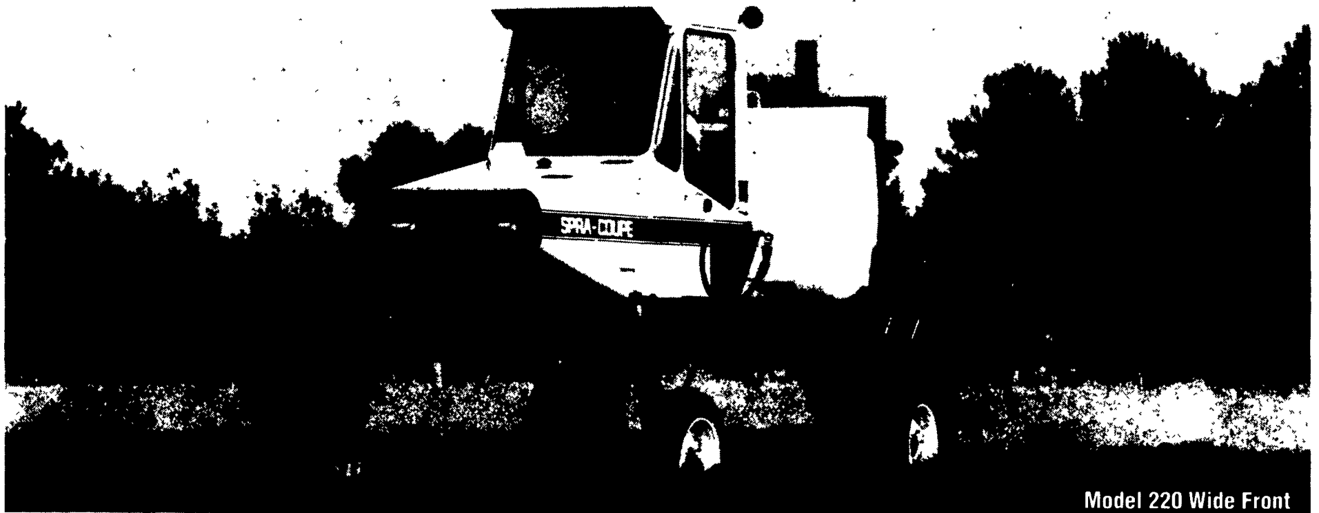
Model 220 Wide Front