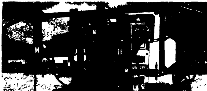
Hydraulic Controls (220-230)

much to you. Check out a Melroe Sprra-Coupe or see a custom applicator who owns a Sprra-Coupe and control your weight!