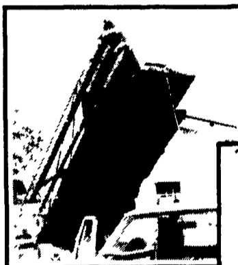
Take 'em Down!

We Stock Truckloads Of Chore-Time Bins & Miles Of Chore-Time FLEX-AUGER