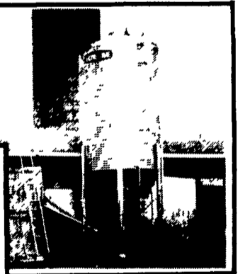
Put 'em Up!

We Stock Truckloads Of Chore-Time Bins & Miles Of Chore-Time FLEX-AUGER