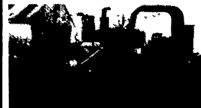
JD 555 Rebuilt Trans., New Pins & Bushings $15,000