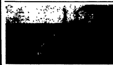
JD 450 New Pins, Bushings & Sprockets $8,800

Customs Repairs On All Makes Industrial & Farm Equipment