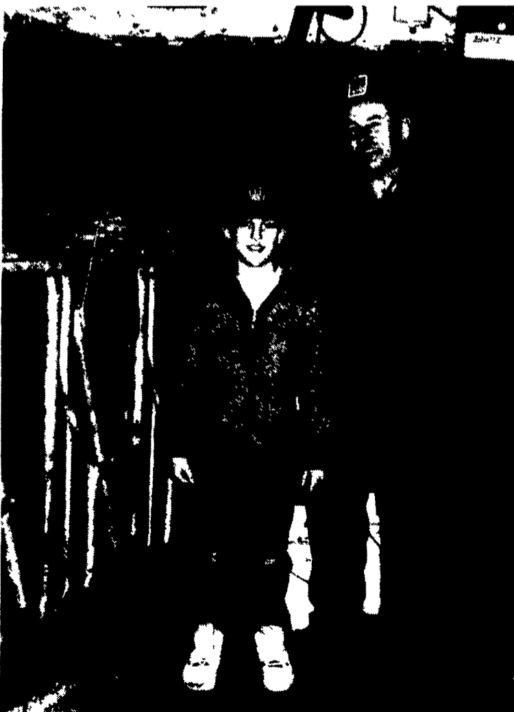
Whether it's feeding calves, hauling sawdust, or attending sales, good relationships are built by working together.