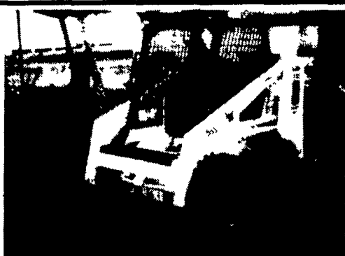
BOBCAT 732 Skid Steer Loader Deutz Diesel, New Hydraulic Sector, 40% Tires, $7,500

Want To Sell-Make an Offer Curry Supply Co. Curryville, PA Call 1-800-345-2829