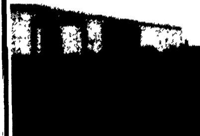
Case 450 Crawler Loader $6,800