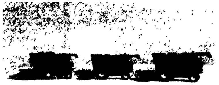
The new Case International 1644, 1666, and 1688 combines, which feature higher horsepower and a superior cleaning system, harvest better quality grain and more of it.

According to Salzman, the chevron pattern and cupped blade design of the Cross Flow fan generate more air volume at a fraction of the previous fan's horsepower