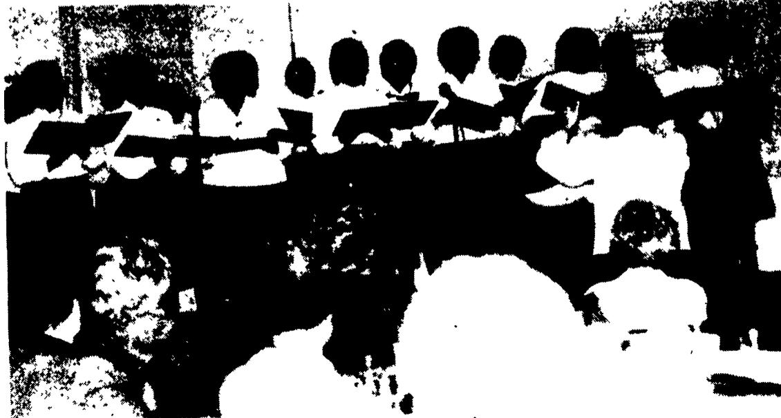
The Hollyhocks, farm women members from Dauphin County, provided special music during the banquet.