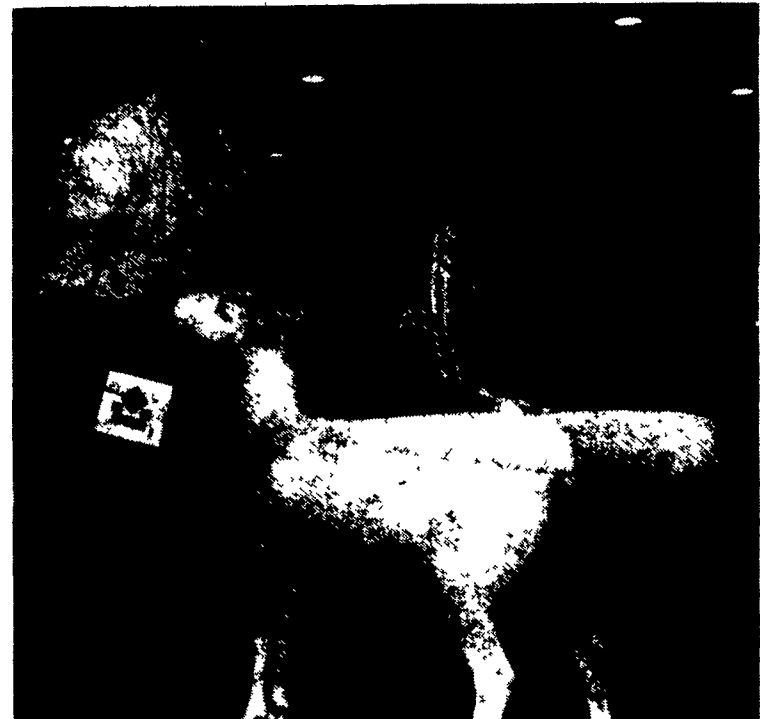
Darren Grumbline shows for champion Tish Ebling in the Montadale ewe class in the junior show.