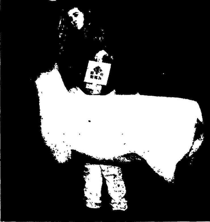
Showing for Amy Clair, Stacy Suffel shows the Suffolk champion ewe at junior breeding show the Farm Show.