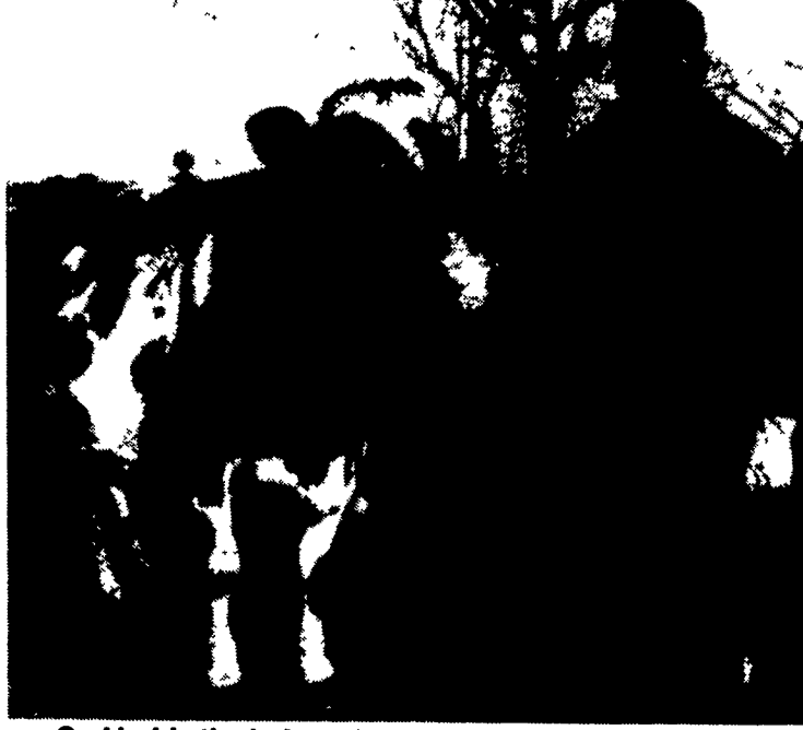
Carl holds the halter of Emaline, who is due to give birth during Farm Show week.