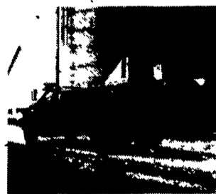
Truck-mount conversion package available for hauling long distances

So test your manure and soil. Then see your White-New Idea dealer for all the manure application rate details.