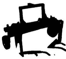
CHALLENGER MODEL 1800 PLASTIC LIFTER

Mfg. of Vegetable Machinery - We Stock The Following Supplies: Plastic Mulch, Drip & Overhead Irrigation, PTO, Engine & Submersible Pumps, Greenhouse Supplies & Plastic, Aluminum & PVC Pipes & Fittings, Layflat Hose, Harvesting Baskets, Emitters & Orchard Drip Systems, Sand, Disk & Screen Filters, Auto or Manual Backwash. This is Only A Partial Listing. "Let Our Experience Help You With Designing Your System" Call Or Write For Free Catalog