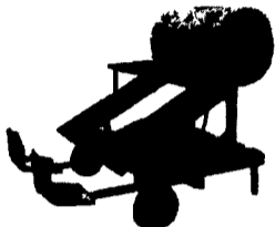
MODEL 1400 WATER WHEEL TRANSPLANTER