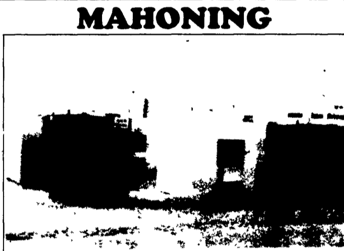
We have a variety of styles & sizes, and one to fit your home/business heating needs!

For more information see your nearest dealer.