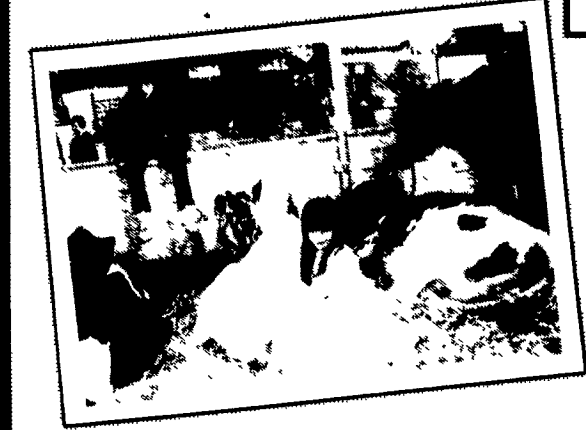
PENNSYLVANIA FARM SHOW Harrisburg, PA