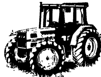
AA 6690 TRACTOR DEMO AWD, CAB