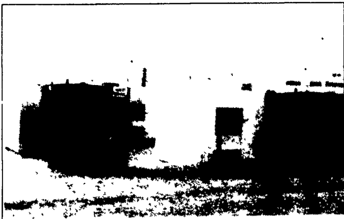
We have a variety of styles & sizes, and one to fit your home/business heating needs!