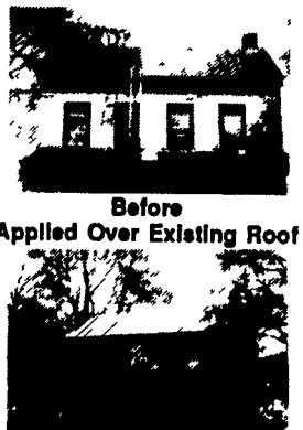
Before Applied Over Existing Roof