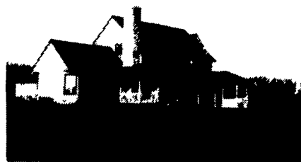
Good For All Roof Angles