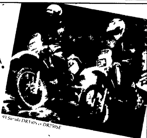
93 Suzuki DR350S or DR250SE