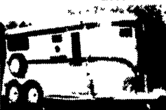
Two horse with 5 ft. dressing room