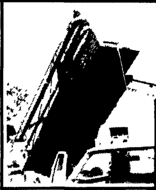
Take 'em Down!

We Stock Truckloads Of Chore-Time Bins & Miles Of Chore-Time FLEX-AUGER