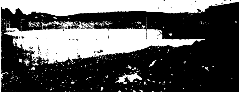
12' x 83' Diameter Circular Manure Storage - Franklin County, PA

Specializing in Manure Storage Round or Rectangular In Ground or Above Ground