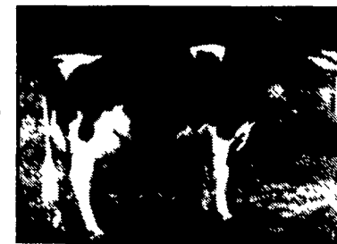
Buckanser Daughter: Der Dele Buckanser Bambs ( 2-06 2x 351d 26307M 2.8% 737F 2 9% 762P Inc Dixie Dall, Glen Rock, PA

Sire: Hanoverhill Starbuck 40353790 EX-EXTRA Maternal Grandsire: S-W-D Valiant 1650414 EX-95 GM