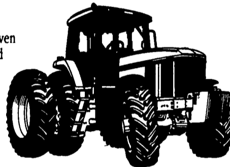
AN ALL-NEW BREED OF POWER