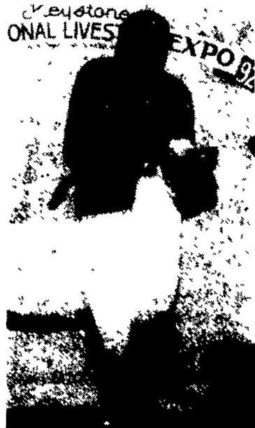
Jason Blixer shows the grand champion Oxford ewe.