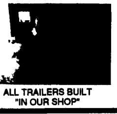
ALL TRAILERS BUILT "IN OUR SHOP"