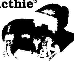
New Thrifty King™ Cattle Fountain

★ Thrifty King™ Hog Fountains Also Available ★