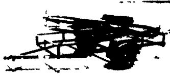
4x8, 5x10, 6x12 UTILITY TRAILERS STARTING AT $499