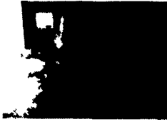
ALL TRAILERS BUILT "IN OUR SHOP"