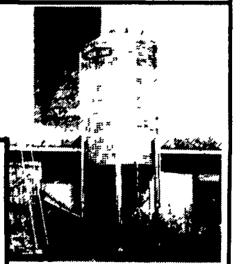
Put 'em Up!

We Stock Truckloads Of Chore-Time Bins & Miles Of Chore-Time FLEX-AUGER