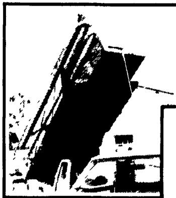
Take 'em Down!

We Stock Truckloads Of Chore-Time Bins & Miles Of Chore-Time FLEX-AUGER