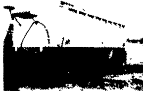
1969 Stecco 28 Ft. Alum. Dump Trlr $4,900