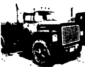
1977 Int-H 1850 Loadstar s/a Tractor Diesel, Rebuilt 453; Detroit; 5&2; Heater Plug; Tilt Hood $1,500