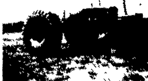
WC Allis Chalmers Farm Tractor $800 $400