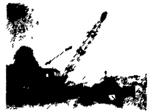
P-H Crane 25 Ton with 50 Ft. Boom $2,500