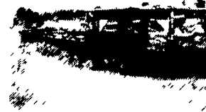
Hale Gooseneck Flat Bed Trlr, 36' Floor, 8' Deck, 7.50 16 Tires, 8,000 GVW $3,300