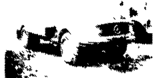
1977 MercBenz 1500 Gal. Vac. Septic Truck Diesel $9,500 $7,500