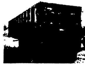
1974 Stecco Steel Demo Dump Trlr $2,900