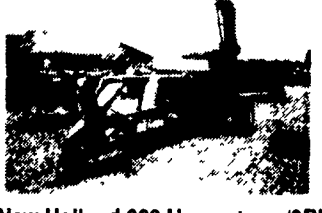
New Holland 890 Harvester w/2RN, Also Hay Head And 2RN Snapper Head Available. (Will Separate)