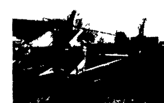
John Deere 38 Harvester w/2RW Corn Head And Hay Head, $1,850.