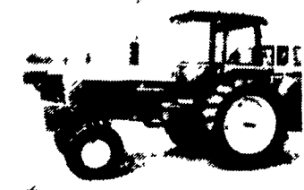
1975 JD 4230, Quad New 18.4x38, Front Weights.