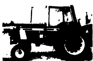
1976 IH 986, 18.4x38, Front And Rear Weights.