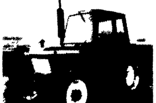
1982 Ford 5610, 4WD, New Tires, Cab w/Air.