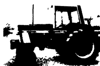
1976 IH 1086, Front And Rear Weights, A Nice One.