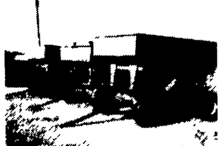
(5) Gravity Flow Wagons, Prices As Low As $950.