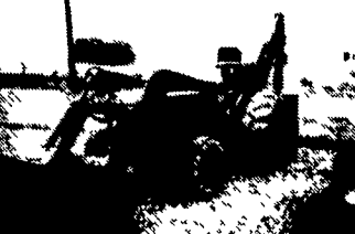
Massey Ferguson 35 Tractor/Loader/Backhoe, Looks Poor But Runs OK, Cheap Backhoe, $3,900.