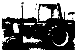
1976 IH 1486 Front And Rear Weights, Very Good.