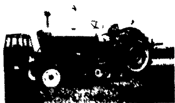
1972 Ford 4000, Diesel, 8 Spd. Trans., 15.5x38 Tires, With Or Without 4 Row Front Mt. Cult.