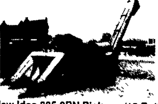
New Idea 325 2RN Picker w/12 Roll Husking Bed Also 324 2 RW Available. Don't Wait Till There Gone!