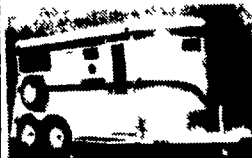
Two horse with 5 ft. dressing room