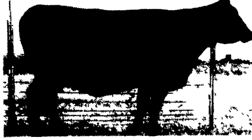
SITZ FLORABELLE FANNY 705

Selected as one of the most popular cows in the Sitz Dispersal, this big, strong, productive daughter of G D A R Rainmaker 340 from a dam by CSU Rito 4114 sells bred to Hyline 9J9 278 with a heifer calf at side by a top son of PS High Pockets.