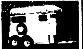
Two Horse Thoroughbred Deluxe