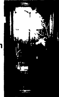
Loads of Good Food Including Chicken Bar-B-Que, Baked Goods Ice Cream & Milkshakes

HANDCRAFTED CUSTOM MADE SOLID WALNUT CORNER CUPBOARD, GLASS DOORS w/Mullions & Raised Panel Doors 28"x28" Wall Space NOVA Hit Or Miss Engine - Good Running Condition