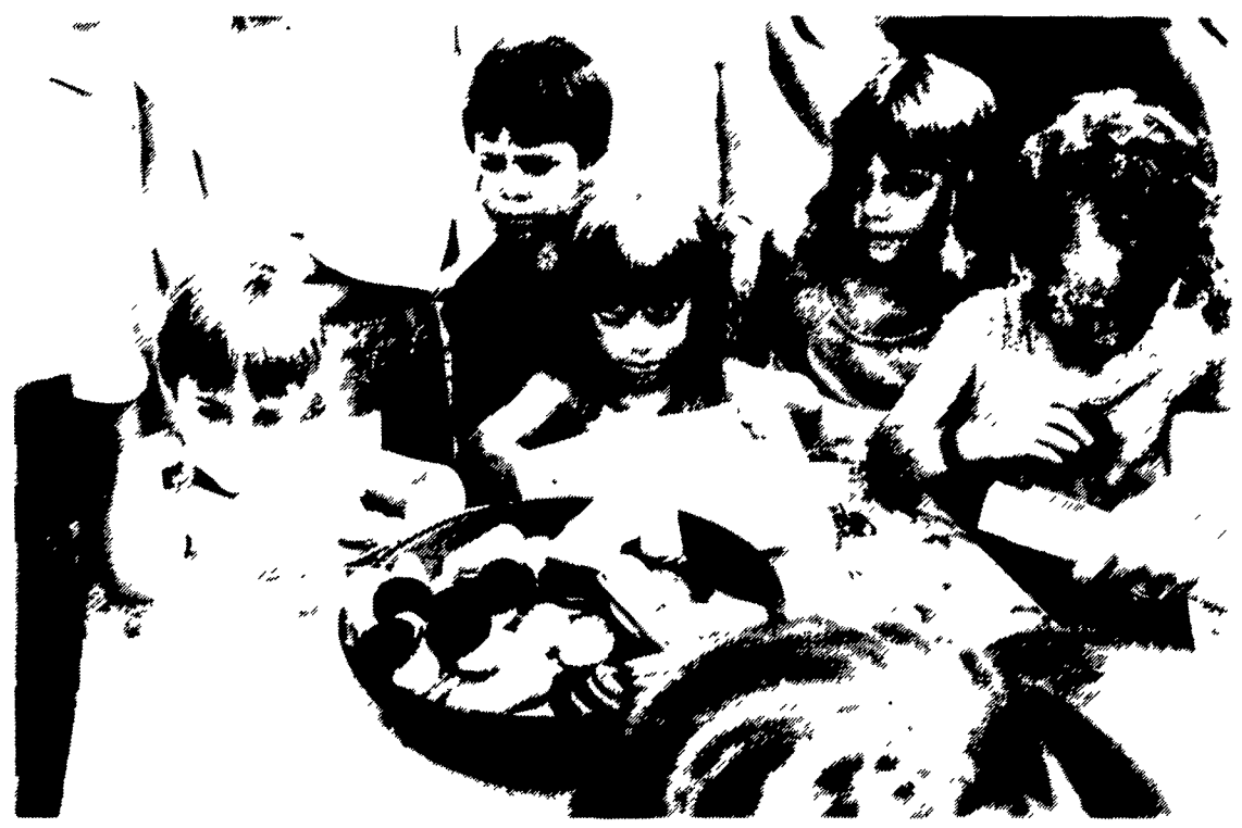
In the Cookie Stackup competition, children of the same age try to build the highest stack of cookies within one minute.