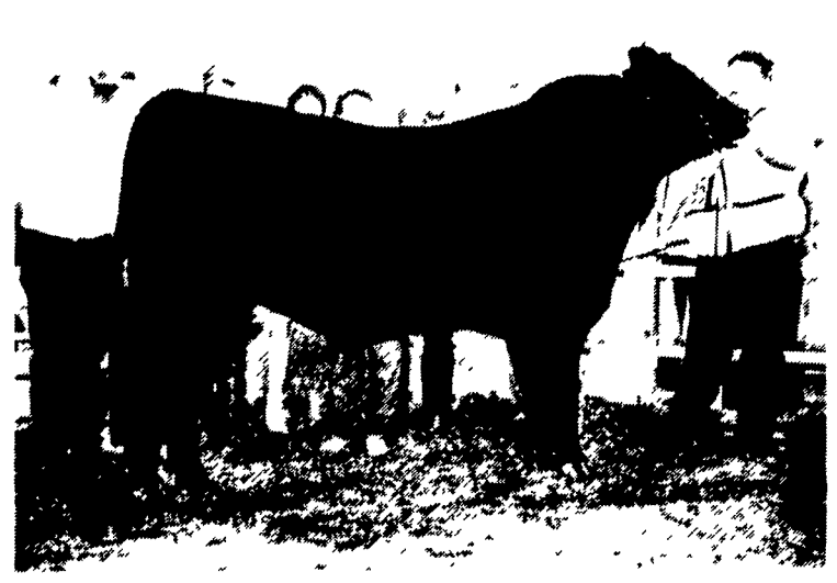
Clear View Cosmo is the name of this grand champion bull at the 1992 West Virginia State Fair Angus Show in Lewisburg. The grand winner was first named the senior champion. He is owned by Clear View Farm, Louisa, Virginia, and is a March 1990 son of Grubbs Mac Kenzie.