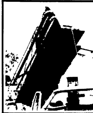
Take 'em Down!

We Stock Truckloads Of Chore-Time Bins & Miles Of Chore-Time FLEX-AUGER