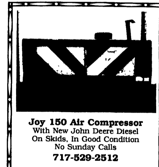
Joy 150 Air Compressor With New John Deere Diesel On Skids, In Good Condition No Sunday Calls 717-529-2512

20 Bu. Bulk Bins: 42"x42"x36"H, $7 each. (717)382-4878.