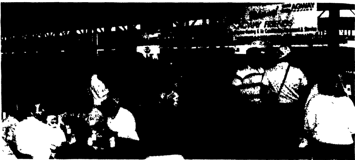
While the far free-stall building is full of cows, this new one is lined with commercial exhibits and families who came to the state Holstein picnic to socialize and to see the new 1,600-head free-stall with a double-40 milking parlor at Evergreen Farms.

Denver Community Fair, Denver, thru Sept. 18.