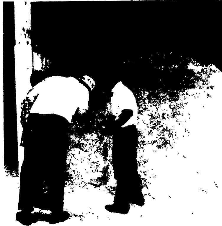
These gentlemen check out soy meal at Evergreen Farms during the state Holstein Picnic and open house of R. Wayne Harpster's new 1,600-head free-stall dairy facility.

The facility is one-of-a-kind in design, size, and siting. The Evergreen Farms has hosted the state picnic previously, but never have that many people attended. The picnic was combined with a general open house.