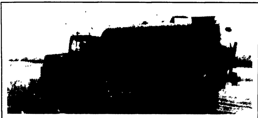
4000 Gallon Tanker Spreader