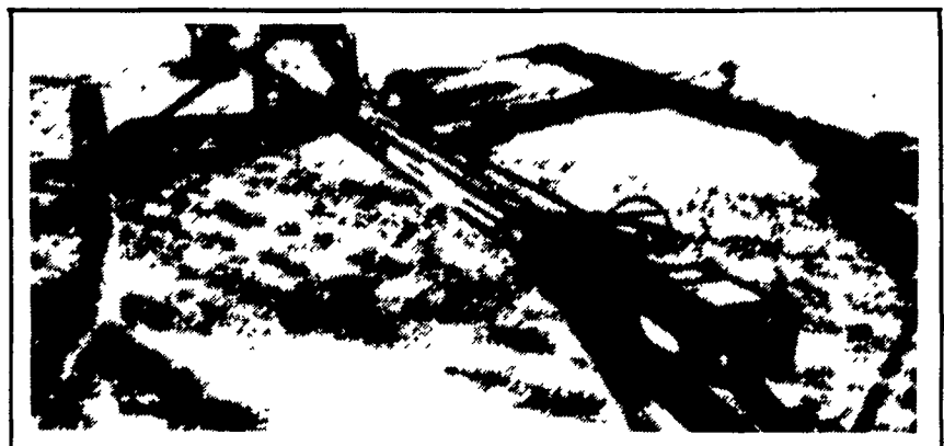
Badger Slurry Mixer