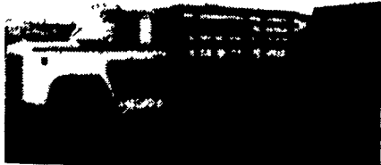
1976 International Harvester 1600 Truck With 18' Morgan Body & Walco Lift 1090; Power Steering, 5 Speed Trans., V345 Engine, 28,524 Miles On Factory Rebuilt Engine (Replaced 6/84). 7500 Lb. Front Axle, 1700 Lb. Rear Axle.

About 100 pieces of framed equestrian art from Equine Gallery including oil paintings, lithos & hand painted prints from England, Ireland, Italy & America, all horse related. Also early Green River advertising; coach lamps; toe-board lamp; tail docker; minia. English coach horn; spurs on display rack for sizing boots; sev. English clocks; carriage & coaching books; coaching horns and rack, to name a few of the fine quality collectibles being offered during this special session.