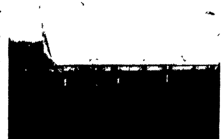
Early Conestoga Style Wagon